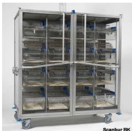
Figure 2: The ScantainerNOVO rat cage system.

C) The traditional breeding method of single housed rats under semi-enriched conditions in type III cages